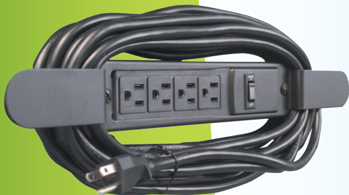
4 outlet with winder