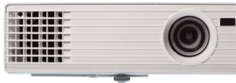
Front 3/4 View