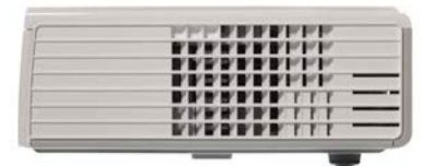
Right Side Profile