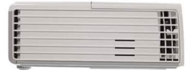
Left Side Profile